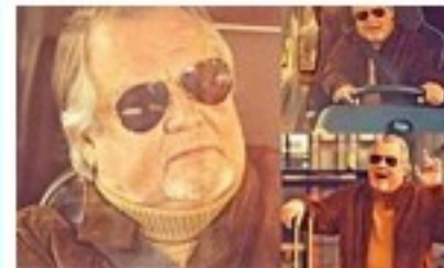
Top 10 most-viewed The Work