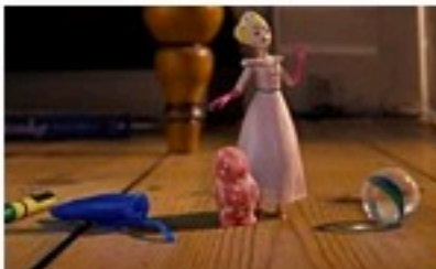
St John Ambulance "the chokeables" by Bartle Bogle Hegarty