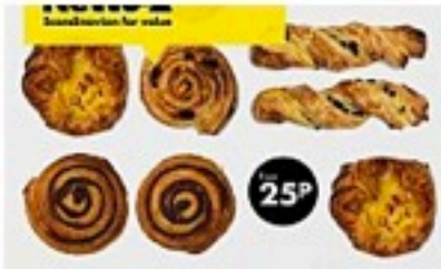
Netto "Scandinavian for value" by 101