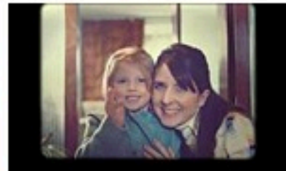
Bupa "elderly care support line" by WCRS