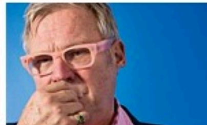
The year ahead for production