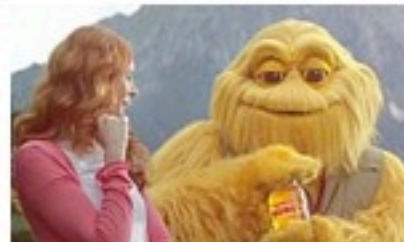
Honey Monster Puffs "monstercatch" by The Gate